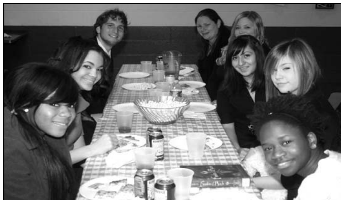
The kids from Mooseheart visited the D.G. Lodge on December 9 for pizza and a Christmas concert at the Tivoli.