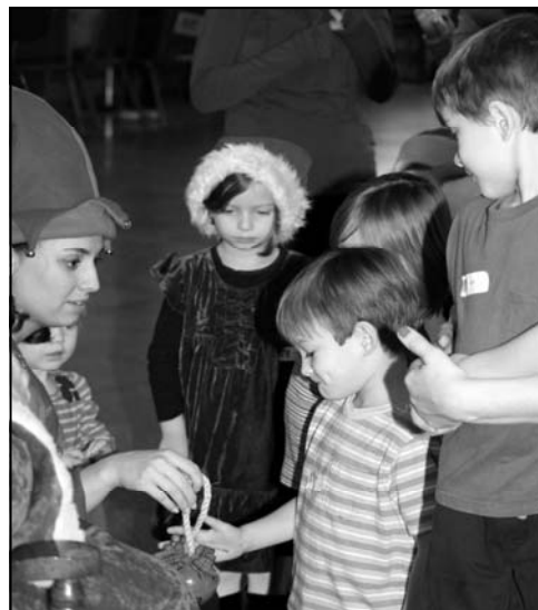
The D.G. WOTM hosted Santa and his elf on December 17. Fun by all!

If you are interested, or know someone who would be interested in the work, please contact the Lodge at 630/968-4550 to set up an appointment to assess the work that needs to be done.