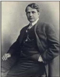
James J. Davis Founder: Mooseheart & Moosehaven